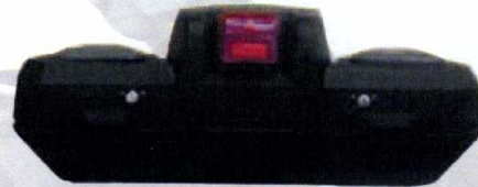
VIEW FROM REAR